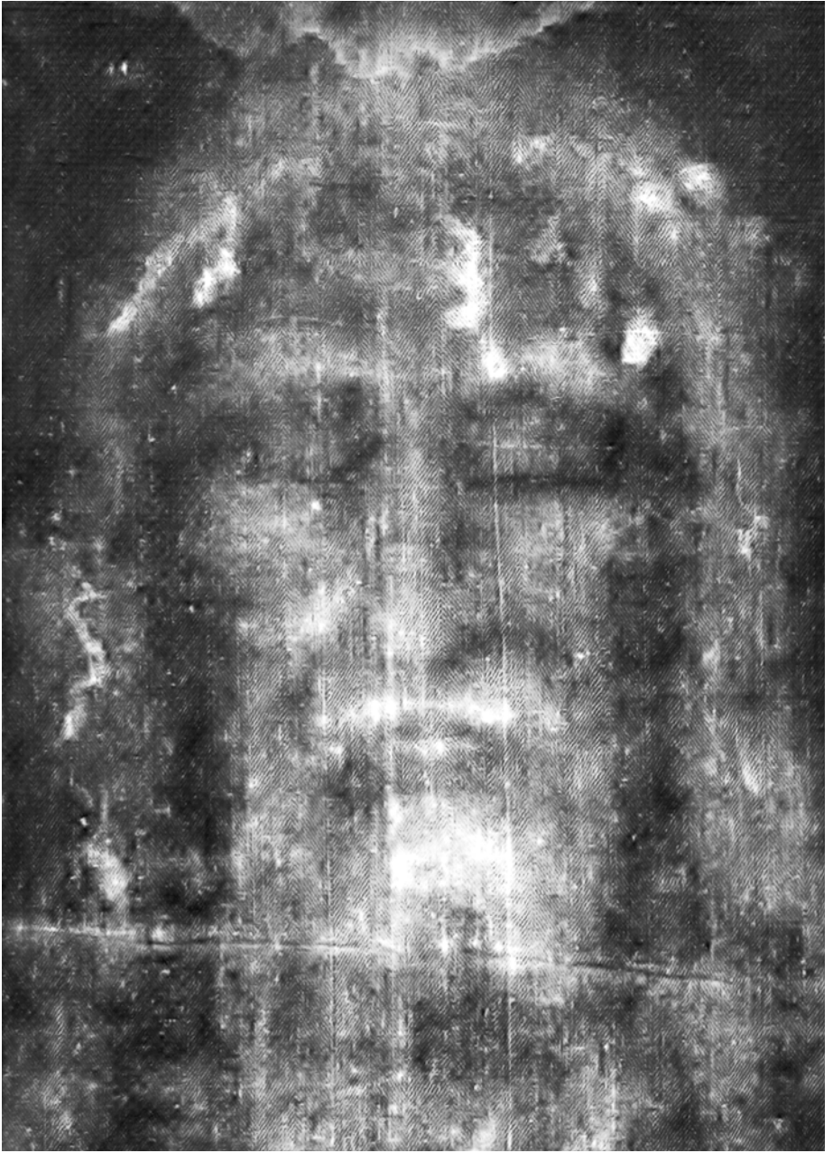
ACTUAL PHOTO OF THE HOLY SHROUD OF TURIN